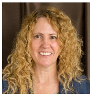
Secretary – secretary@kc.assp.org