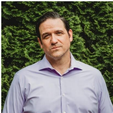
Vice-President – vp@kc.assp.org