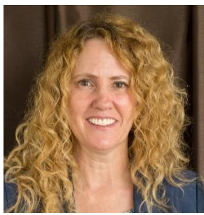
Secretary – secretary@kc.assp.org