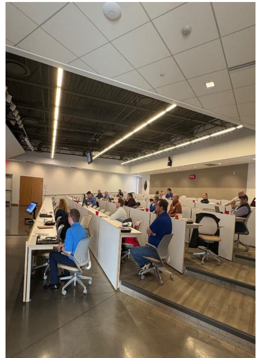
OSHA Attorney Presentation