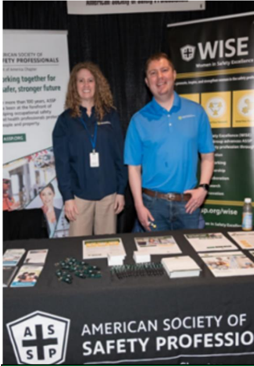
Our Chapter's Promotional Table at the MCSC