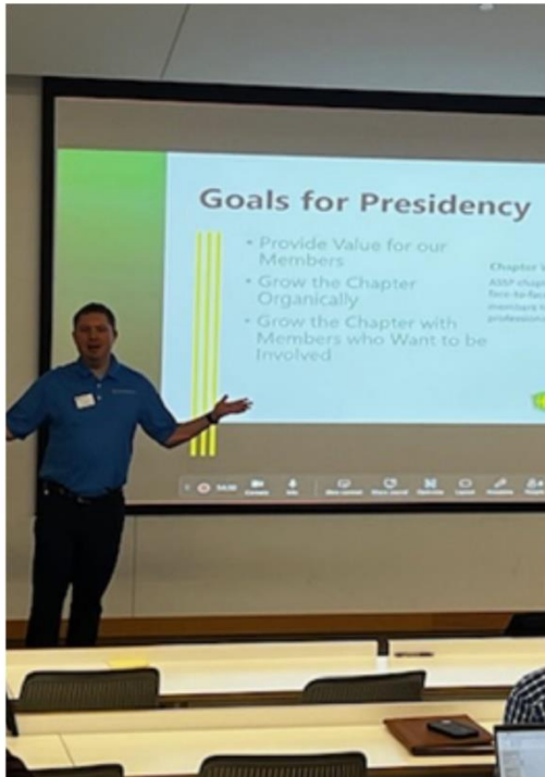
OSHA Attorney Presentation President's Message