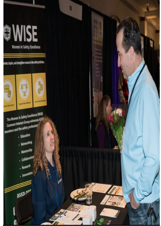
Our Chapter's Promotional Table at the MCSC