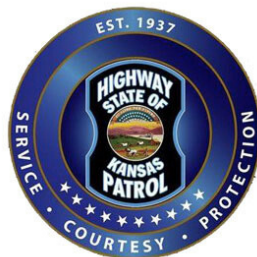
Kansas Highway Patrol